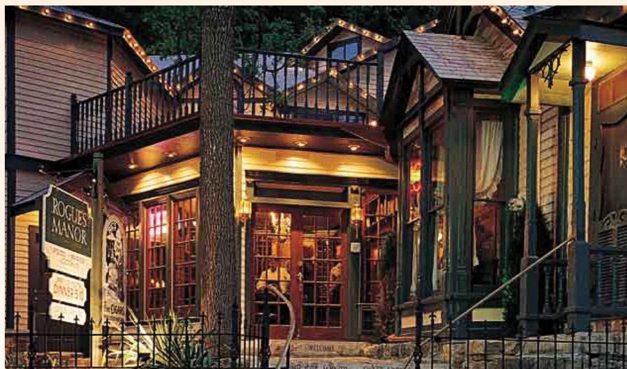
▲ Rogue's Manor at Sweet Spring

should be on everyone's list when coming to the area.