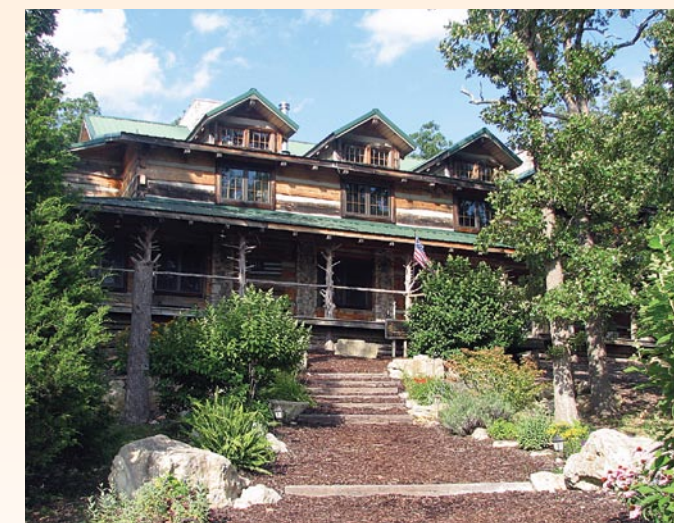
▲ Second Creek Farm's timber frame, hand-hewn log home.