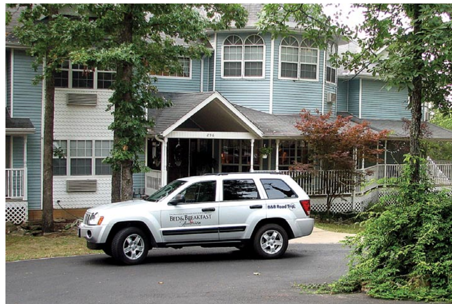
▼ The Bradford House in Branson, Missouri

The B&B where we stayed was off the beaten path, in a beautiful wooded setting. The Bradford House is a beautiful inn, decorated very much in keeping with the Victorian era, complete with attractive antique furnishings. It is quiet, very clean