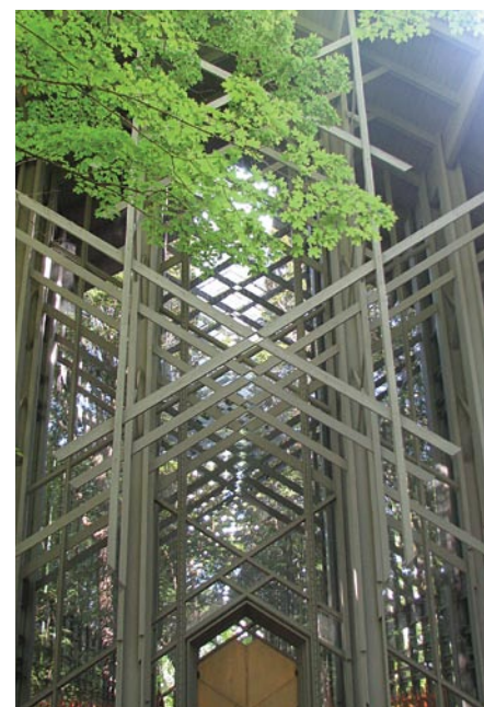
▼ Thorncrown Chapel

On our way out of town, on the outskirts of Eureka Springs, we made one last stop to see the incredible Thorncrown Chapel. Nestled in a woodland setting, Thorncrown rises forty-eight feet into the Ozark sky. This magnificent wood and glass structure is not to be missed and