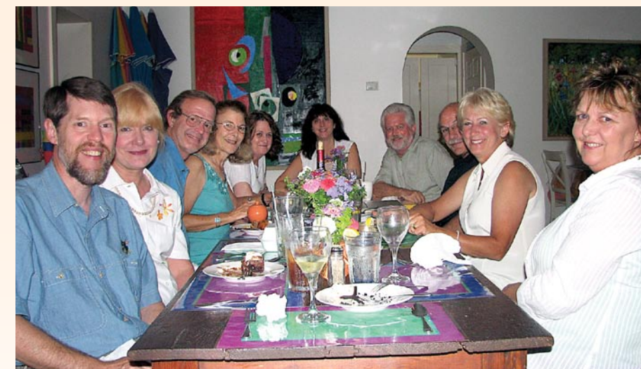
▲ Our last evening in Hermann at the Cottage Restaurant with our hosts and Innkeepers