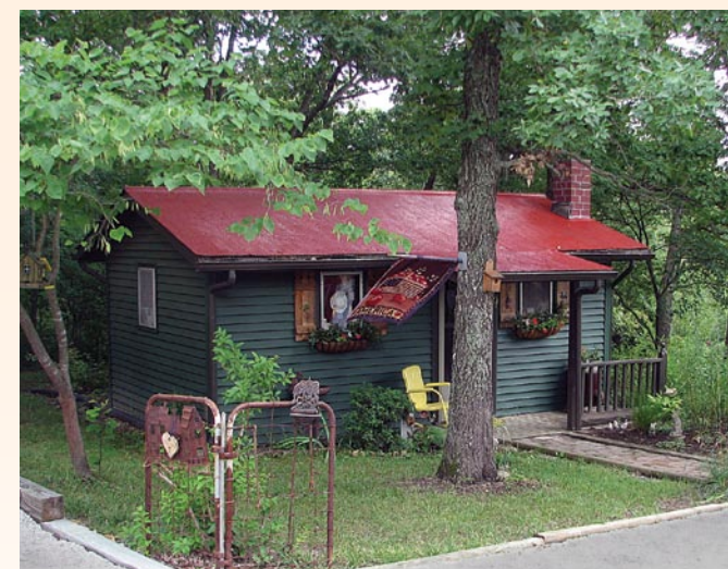
▲ The quaint & rustic Cabin at Woodmere

and I learned that we would be staying at the HHVH location instead of the inn, we thought we were in for a quaint experience. Quite the contrary, but in a fabulous way! Each cottage is packed with luxurious amenities such as a huge deck with spectacular, up close views of the beautiful Missouri river, an elegant and comfortable king size bed, two (yes, two!) plasma screen TVs, a whirlpool inside and a Jacuzzi hot tub on the deck outside overlooking the river, and a full kitchen. The Village is ideal for visitors who wish a bit more privacy and isolation than a traditional B&B offers. It is an excellent choice for friends or families traveling together but want completely separate accommodations. Breakfast in the cottage was provided in the refrigerator (quiche, croissants, fruit and juice), along with Terry's