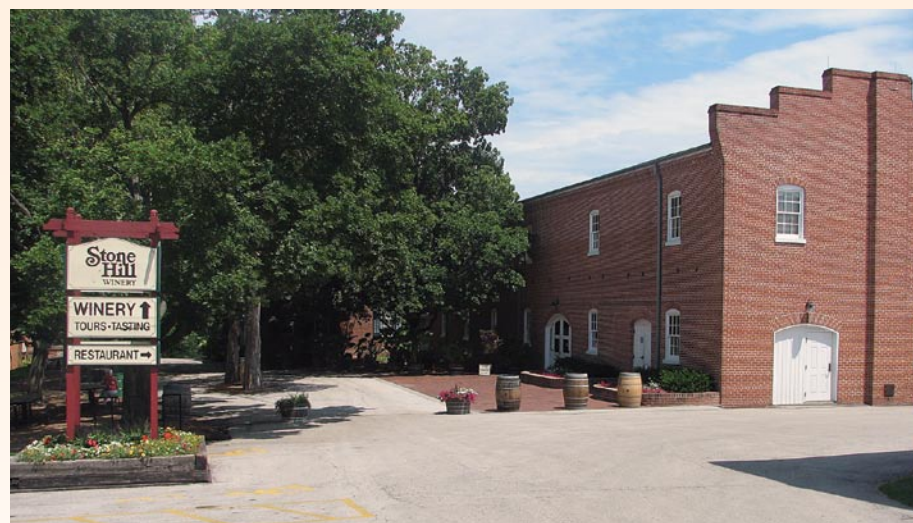
▲ Stone Hill Winery Tasting Room & gift shop