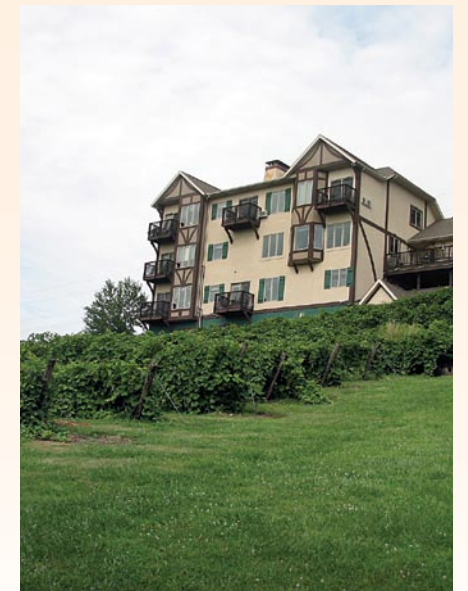
▲ Hermann Hill Vineyard & Inn

We headed out of Branson to our ultimate destination, Hermann, MO. Driving through bucolic countryside and magnificent woods, we all agreed that southwest Missouri is one of the U.S.'s most beautiful landscapes we've ever seen. Driving into Hermann is a "time tripping" experience: you feel that you might be entering a European town at the turn of the 20th century. Hermann's forefathers indeed had foresight. Like so