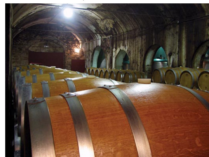
▼ The cellars at Stone Hill Winery

Now back to the Woodmere. In addition to the cabin, Owners Joan and Pete live on the premises in a delightful house, and a barn is nearing completion as extra accommodations. All buildings are in fairly close proximity to each other, but are still very private. The cabin is chock full of wonderful antiques and memorabilia; it truly felt like it might have been your grandparents' vacation or fishing cabin on the lake when you were a kid. The big screened in porch completely transfixed